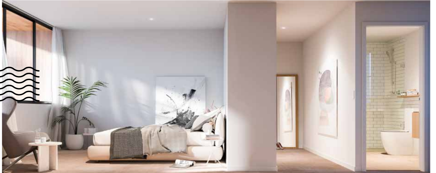
TOP FLOOR MASTER BEDROOM