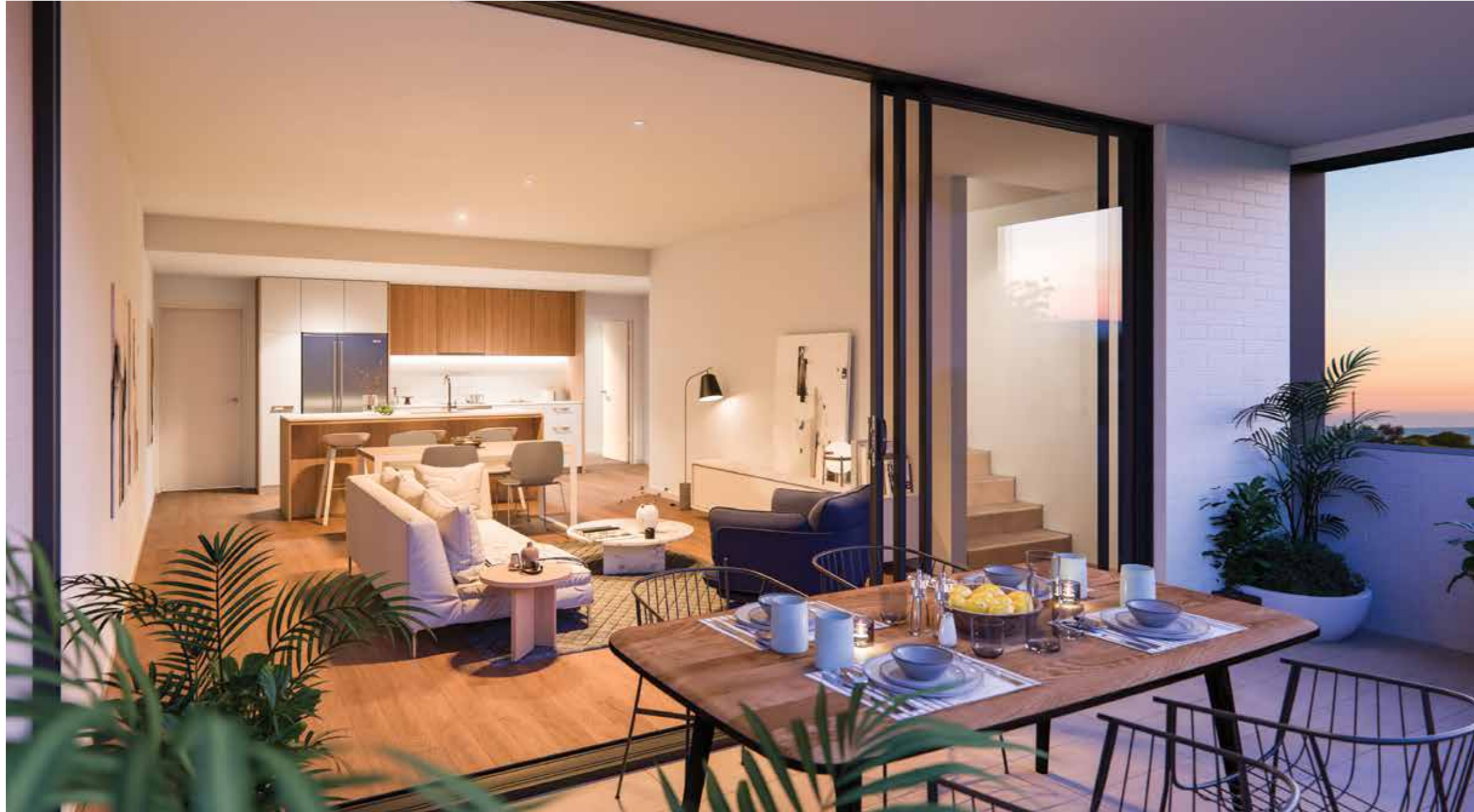
FIRST FLOOR LIVING SPACE, SHOWN IN THE SAND DUNES & SALT SPRAY SCHEME