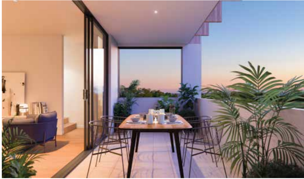
FIRST FLOOR BALCONY