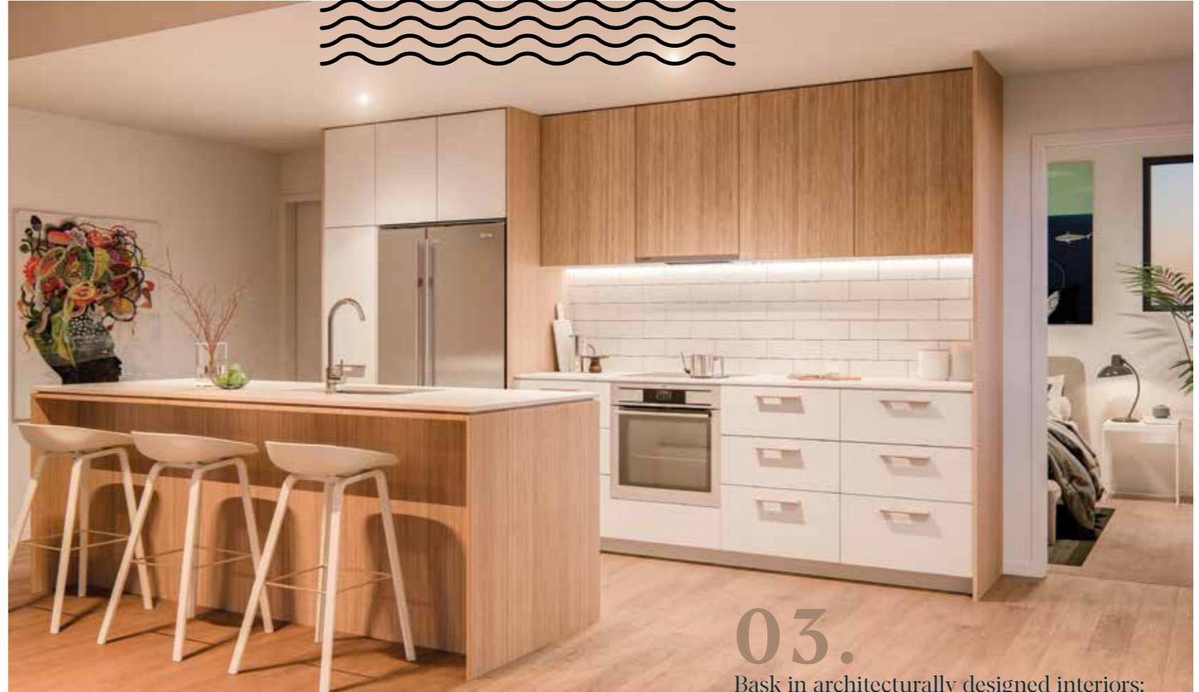
KITCHEN SHOWN IN SAND DUNES & SALT SPRAY SCHEME